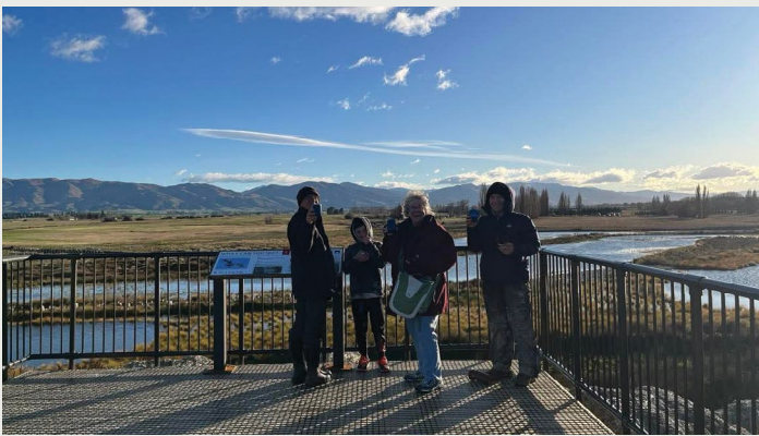
Bird monitoring from the public viewing platform