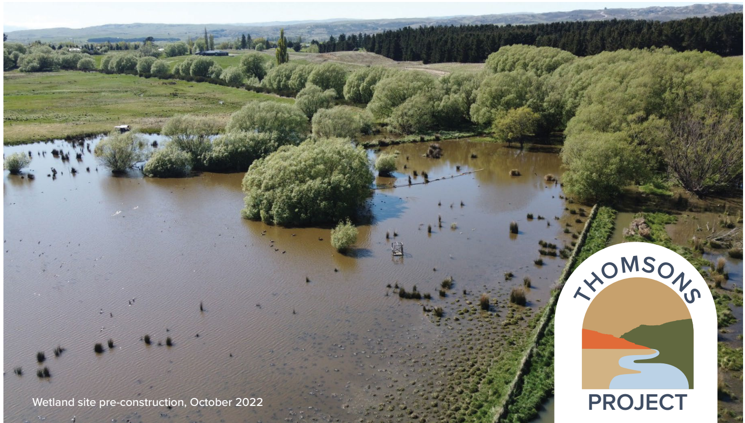
Wetland site pre-construction, October 2022