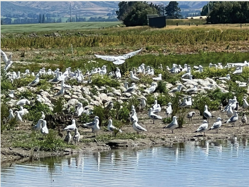
Nesting black-backed gulls took a liking to the flood zone rocks from August 2023 to January 2024

Black-billed gulls nested from September 2023 to January 2024, with numbers peaking at over 1,000 individuals. A second influx in August 2024 did not result in nesting, possibly due to flooding. A marsh crane (small, elusive bird species in decline due to habitat loss) was also recently spotted in the wetland.