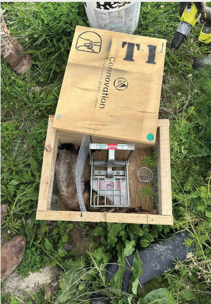
First ferret caught in a DOC250 trap